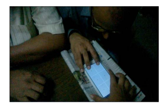
Figure 3.2 AppLock Demo

App Lock is a security module which acts as an authenticator. It is second layer of security which allows only genuine user to access the application. The screen was divided into six equal parts keeping in part blind people's convenience. They had to save passcode first time while logging in by shaking their phone. Then every time the user signs in to the system, he has to type the passcode to get access to the application.