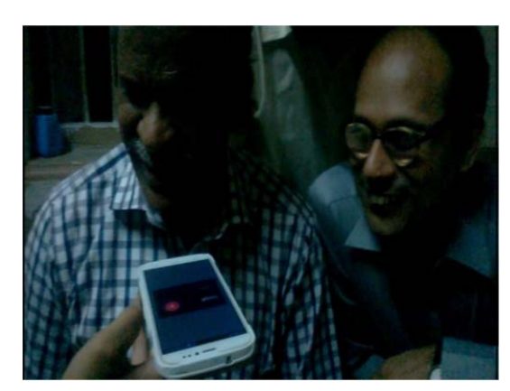
Figure 4.2 VMail Speech Recognition

In Fig 4.1, the user is listening to the voice commands of VMAIL application.